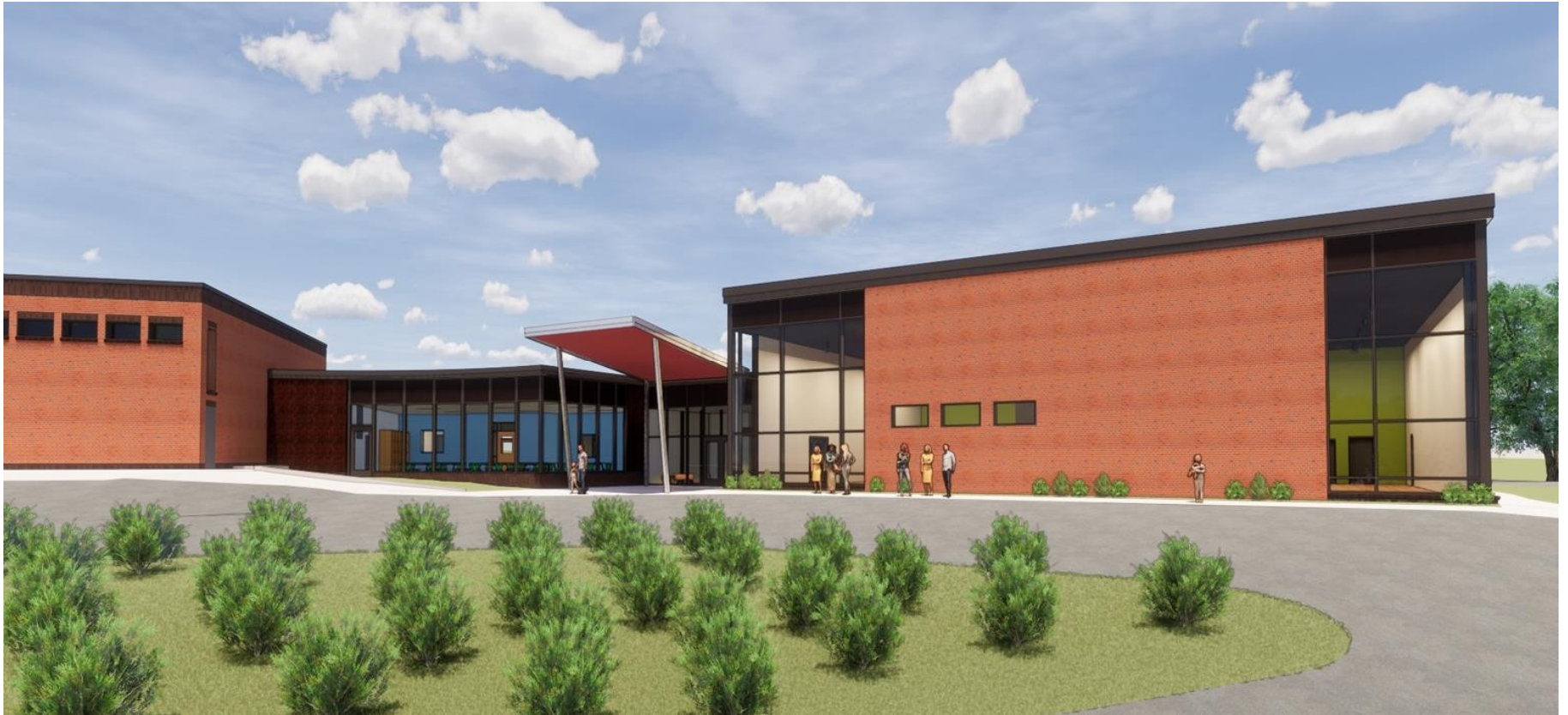
View of Gym Entrance