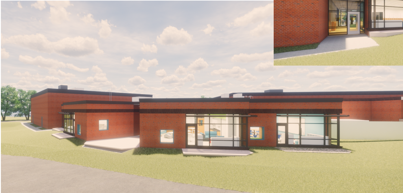
View of Classrooms