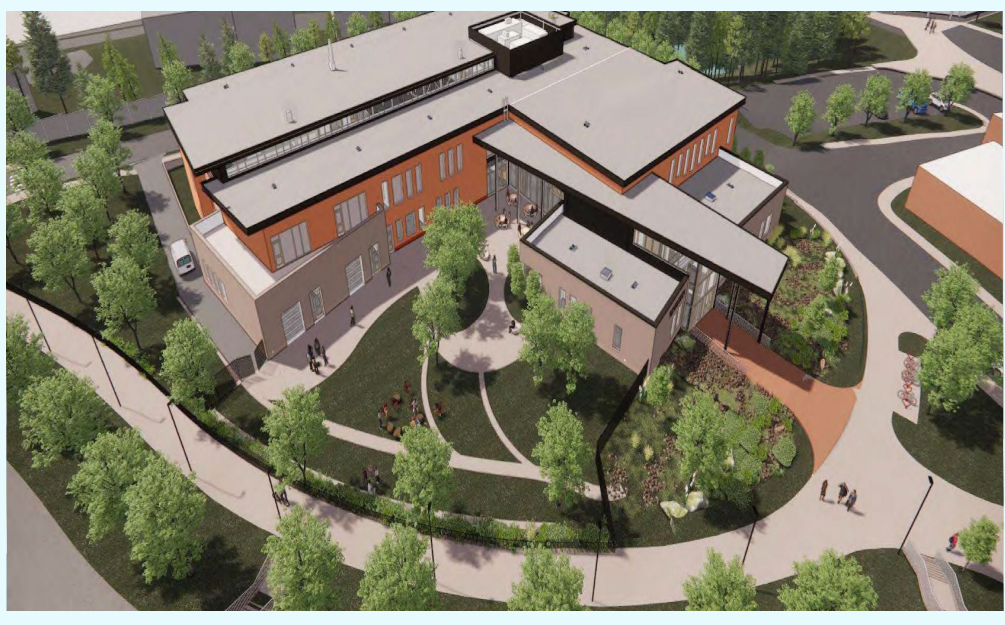
HSC I 1180 Seminole Trail, Suite 225